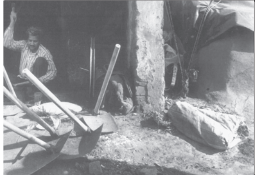
Work and Home