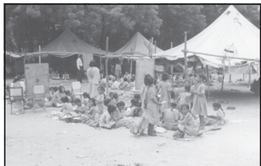
Discuss the visuals (Two types of schools)