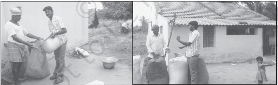
Threshing of paddy in a village