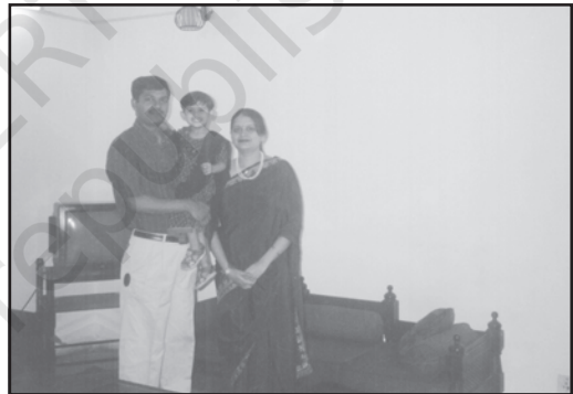
Notice how families and residences are different